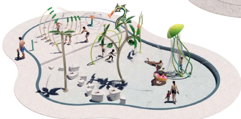
Nature Park (Wading Pool) - 249m 2