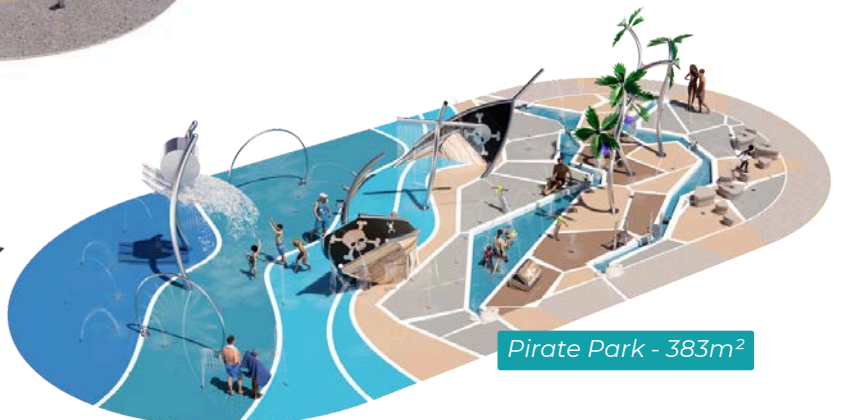
Pirate Park - 383m 2