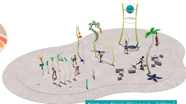
Nature Park (Dipper) - 249m 2