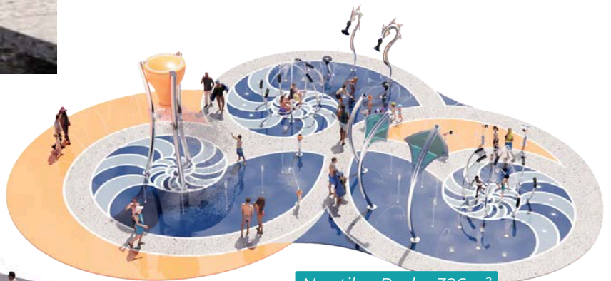
Nautilus Park - 326m 2