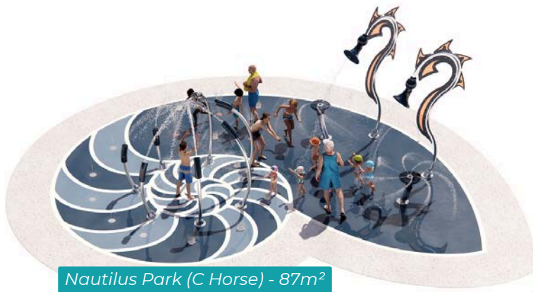
Nautilus Park (C Horse) - 87m 2