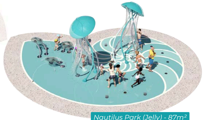
Nautilus Park (Jelly) - 87m 2